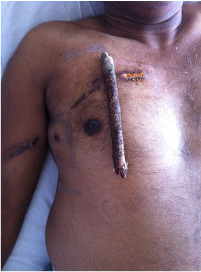
Figure 1: Twig of Falling Tree Penetrating into Thorax through 2 nd Intercostal Space reaching upto Liver.